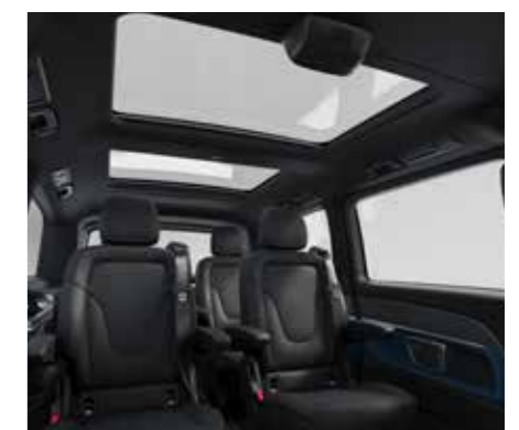
7-seater : 2+2+3 configuration Optimised seating configuration to allow comfortable entrance and exit of the EQV.