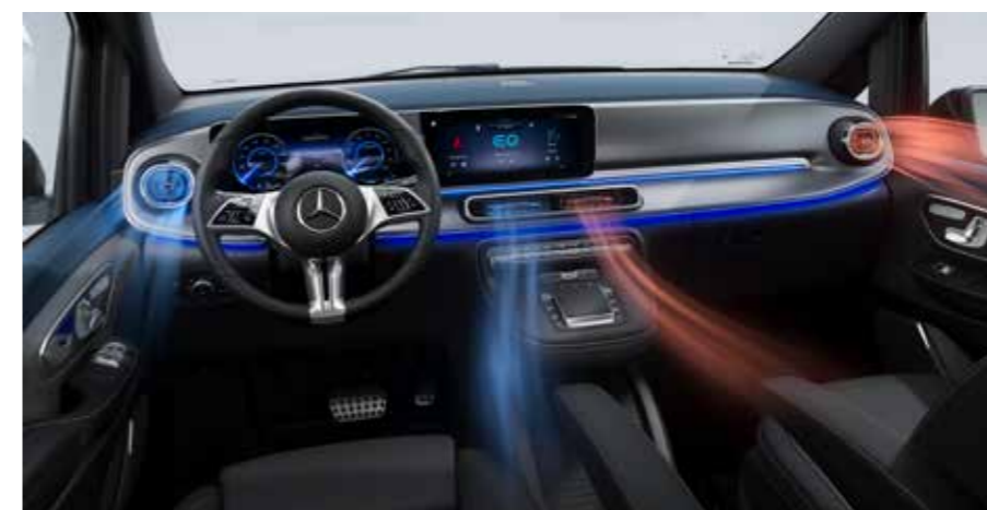
THREMOTRONIC automatic climate control