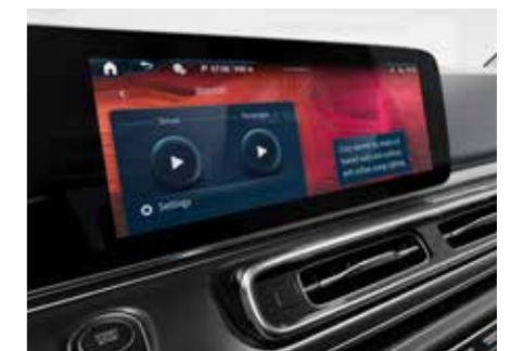
12.3" digital infotainment with MBUX (Mercedes-Benz User Experience) & LINGUATRONIC