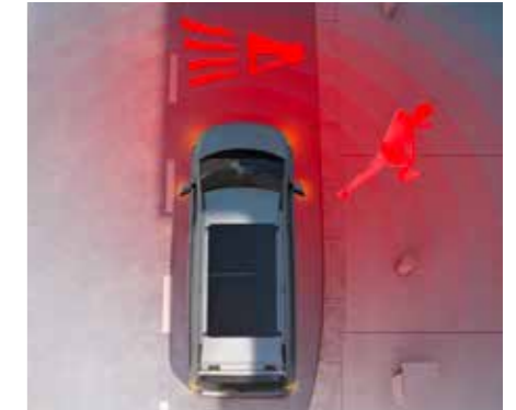
Anti-theft protection package