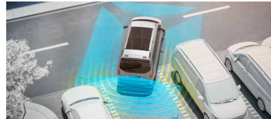
PARKTRONIC ultrasonic parking sensors