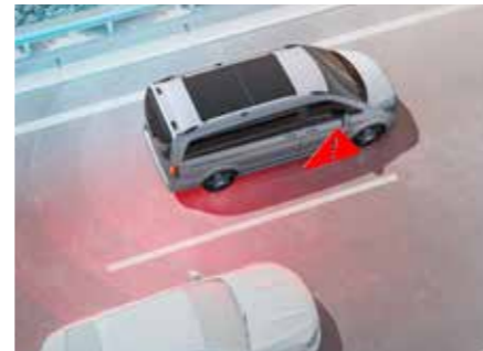
Blind Spot Assist