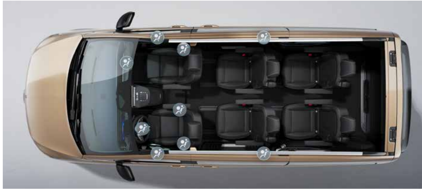
Windowbags for driver, front passenger and in the rear