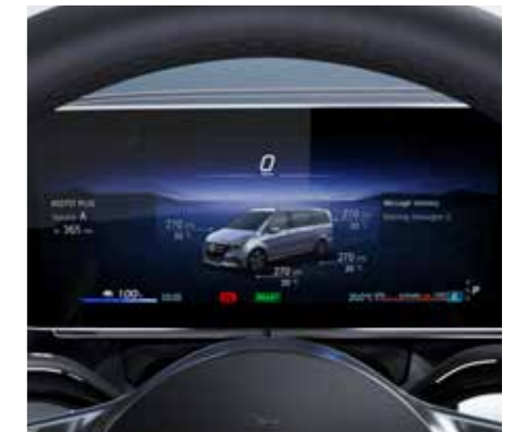
Tyre Pressure Monitoring System