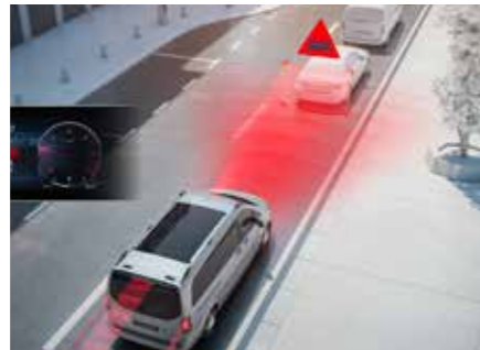
Active Brake assist